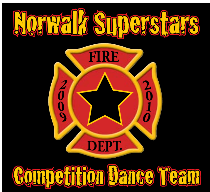
Front: Red and Gold on a Black Shirt